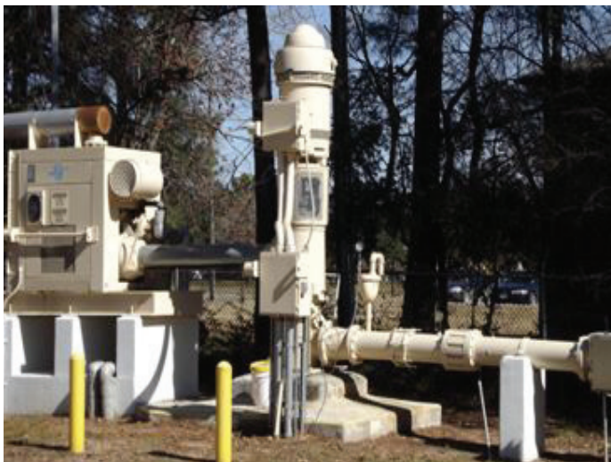
Deep well vertical pump and 400 HP motor at Well-1 Pumping Facility.

Unlike residential consumers, industrial and commercial companies are required to pay for the reactive KVA demand power along with the active KW energy consumed. Each electrical power provider supplies reactive KVA used to produce the magnetic field in the motor that turns the rotor. The rotor converts electrical energy into mechanical energy that drives connected rotating equipment. The KVA electrical power is not consumed like the active KW energy. Utility providers use a demand meter to determine how efficiently a customer is using the supplied KVA energy. The efficiency is measured as percentage below 1.0 or Unity. Power Factor (PF) below 95% has a penalty charge applied to each billing cycle. The monthly electric demand charges can be the major electrical charge for larger motors operating with low power factors. Companies who have optimized Power Factor and avoid PF penalties often achieve a Return on Investment (ROI) within 2 years.